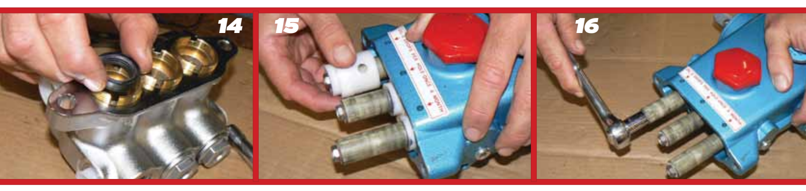
Install Lo-Pressure Seal into each seal case with Garter Spring down .