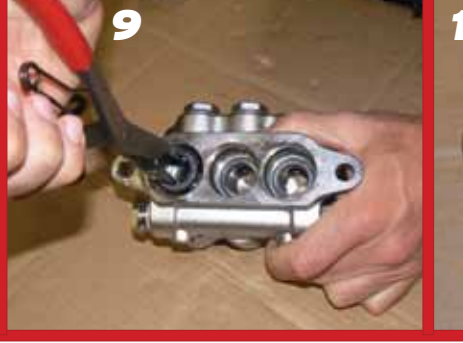
Hi-Pressure Seal is easily removed from the manifold without any tools. If extremely worn a reverse pliers may be used.