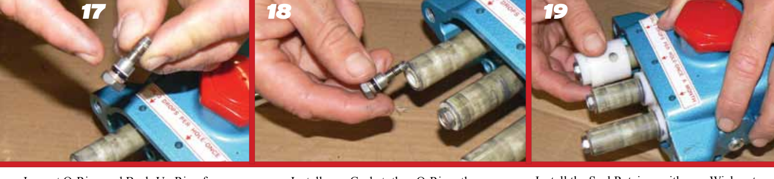
Inspect O-Ring and Back-Up Ring for wear & replace if needed. Examine Ceramic Plunger for scoring, scale build-up, chips or cracks and replace if needed.