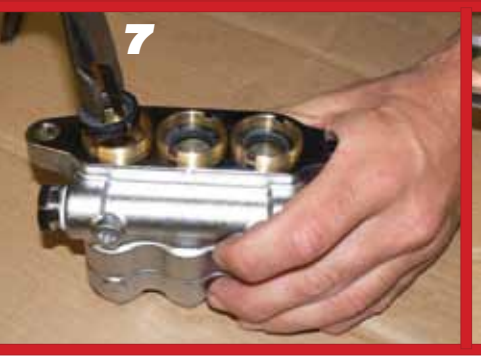
Place Manifold Head on work surface with crankcase side up. Remove Lo-pres sure Seal On 5PFR & 7PFR plunger pumps prior to May 1989, remove Snap Ring & Lo-Pressure Seal from each Seal Case. Discard Snap Rings. On 5PFR & 7PFR plunger pumps after May 1989, remove Lo-Pressure Seal from each Seal Case.

Separate Manifold Head from crankcase by turning the shaft, insert 2 screwdrivers in gap and pry Manifold Head forward until it comes off.