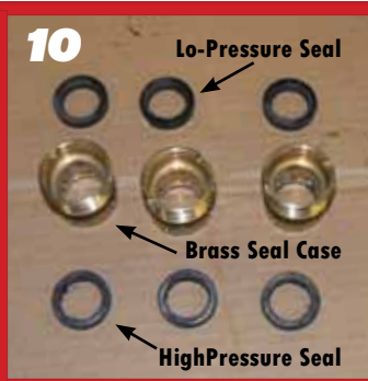
Correct Seal arrangement