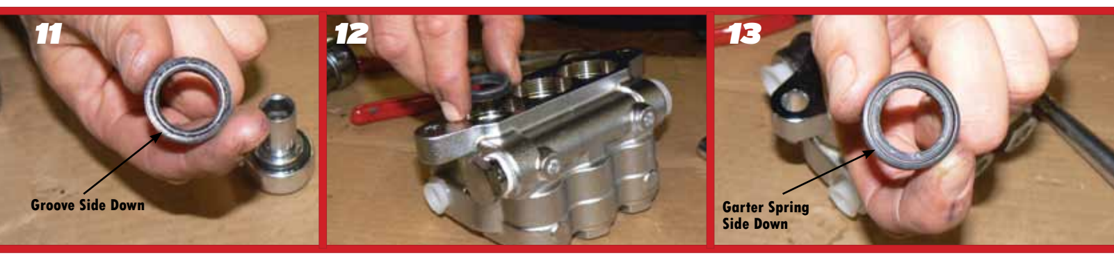
Carefully square Hi-Pressure Seal into position by hand with the grooved side down .